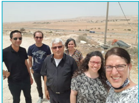
IRAC and Abraham Initiatives staff on a visit to the unrecognized Bedouin villages in the Negev

We are working together with the Abraham Initiatives and the Council of Unrecognized Villages in the Negev towards more accessible polling places for Bedouins living in unrecognized towns and villages in the Negev. In May 2021, we went on a tour together of some of the unrecognized villages, and are working to advance legislative amendments that will allow residents to vote in polling places closer to where they actually live.