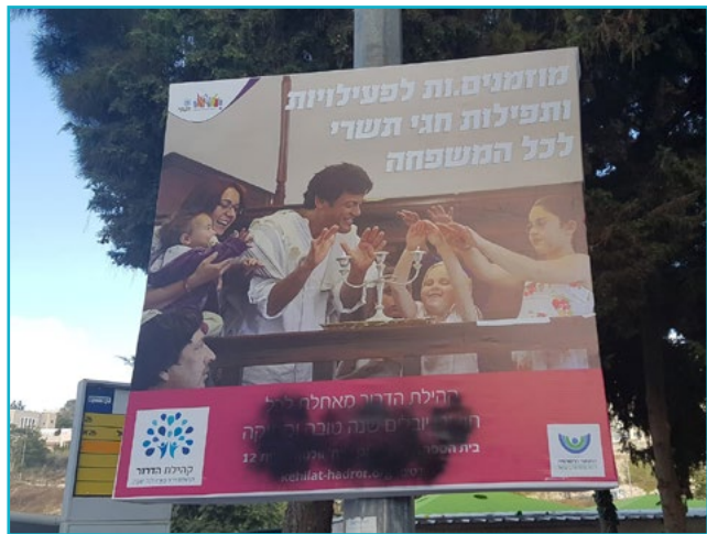
A vandalized advertisement for Kehilat HaDror

on Twitter by Jerusalem's own Deputy Mayor, whose tweet directly led to the defacement of Jerusalem congregation, Kehilat HaDror's advertisements; and by state-employed and funded rabbis.